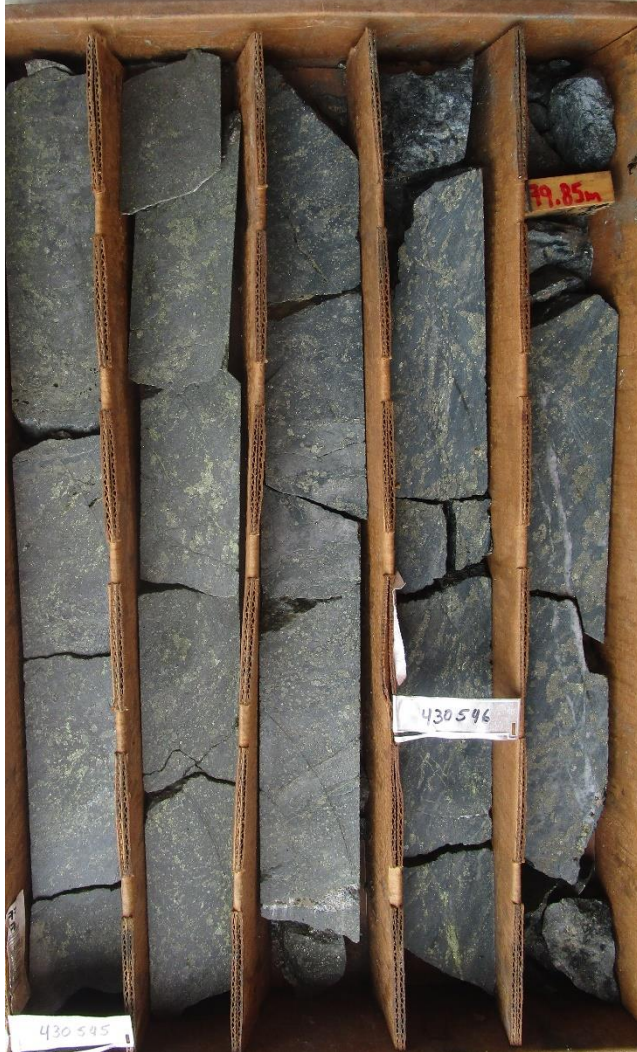
Image 1: Photo of split core from drill hole CC24_001 (77.00m to 79.90m) showing chloritic magnetite skarn with chalcopyrite observed throughout

PROJECT: CORRALCOPPER. HOLE ID : CC24001 BOX : 27 FROM(m) : 77.00 TO(m): 79.90 W