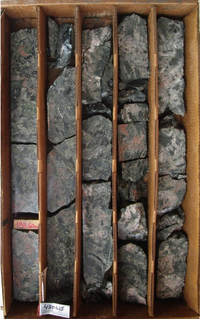
Image 2: Photo of split core from drill hole CC24_001 (189.40m to 192.15m) showing intensely sulfidized and silicic epidote skarn with probable potassium feldspar alteration

PROJECT: CORRALCOPPER. HOLE ID : CC24001 BOX : 68 FROM(m) : 189.40 TO(m): 192.15 W