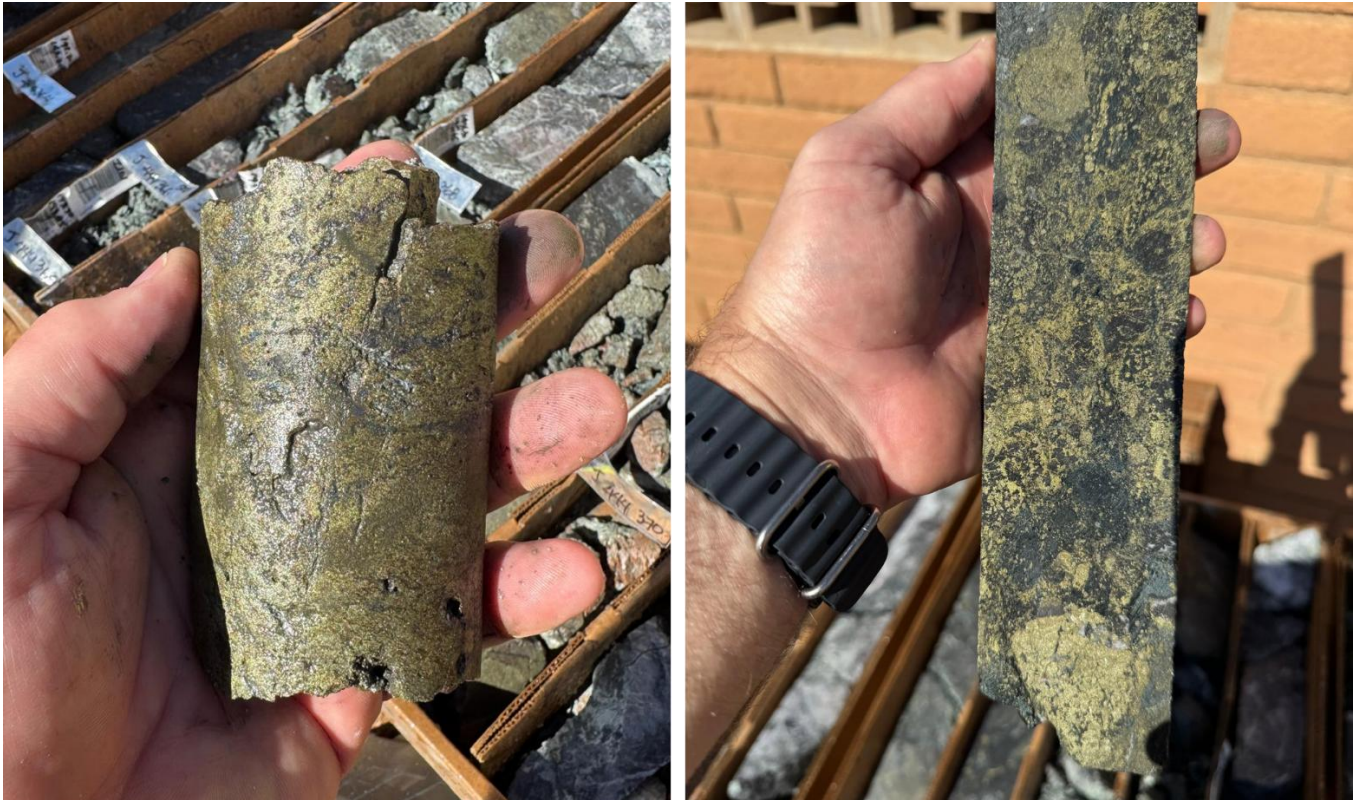
Photos 1 & 2: High-grade replacement style massive sulphide mineralization intercepted in CC25-026 consisting of massive pyrite and chalcopyrite hosted in the favourable Abrigo Formation.